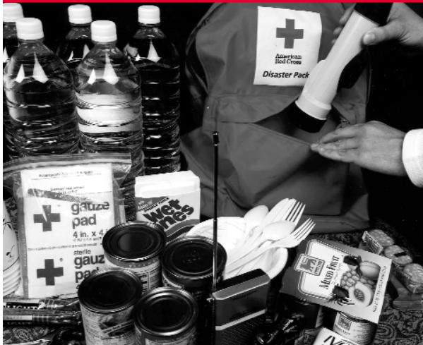
A disaster supply kit, with items like those shown and a radio and extra batteries, is an essential resource in times of emergency.